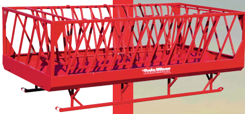
7X13 BALE MISER