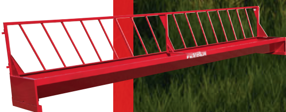
WBF 36\"/>BUNK FEEDER