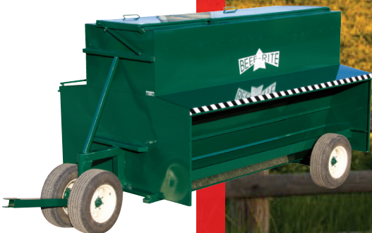
508T BEEF-RITE FEEDER