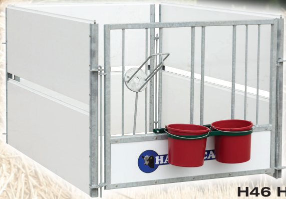
H46 HAPPY CALF