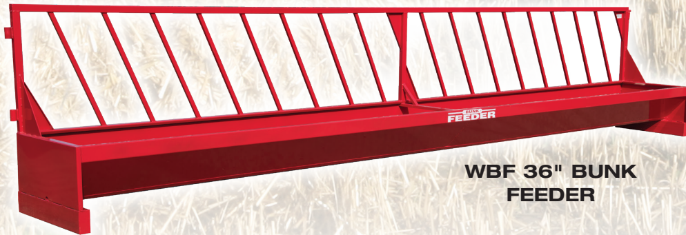
WBF 36" BUNK FEEDER