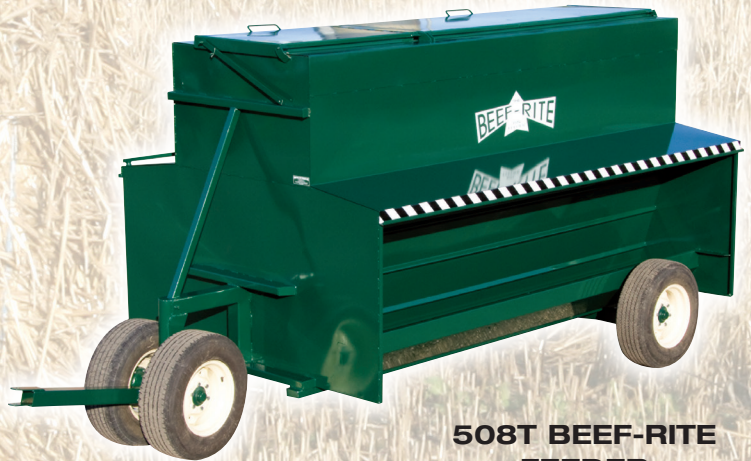
508T BEEF-RITE FEEDER