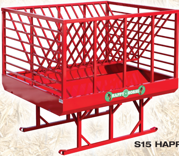
S15 HAPPY HORSE