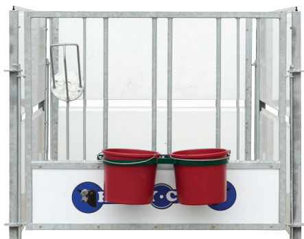
S72 - SIDE PANEL